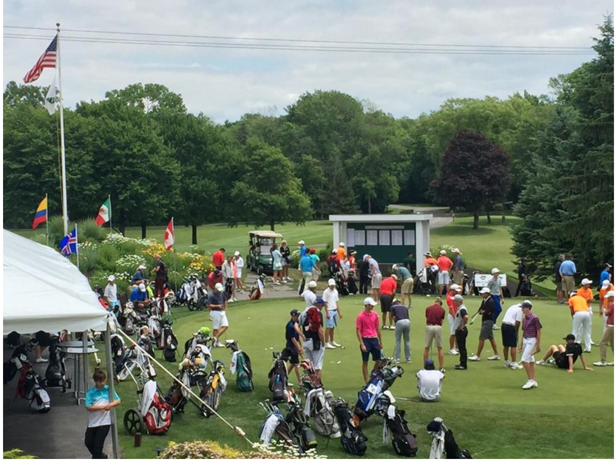
The Putting Green – the Center of Activity for the Week